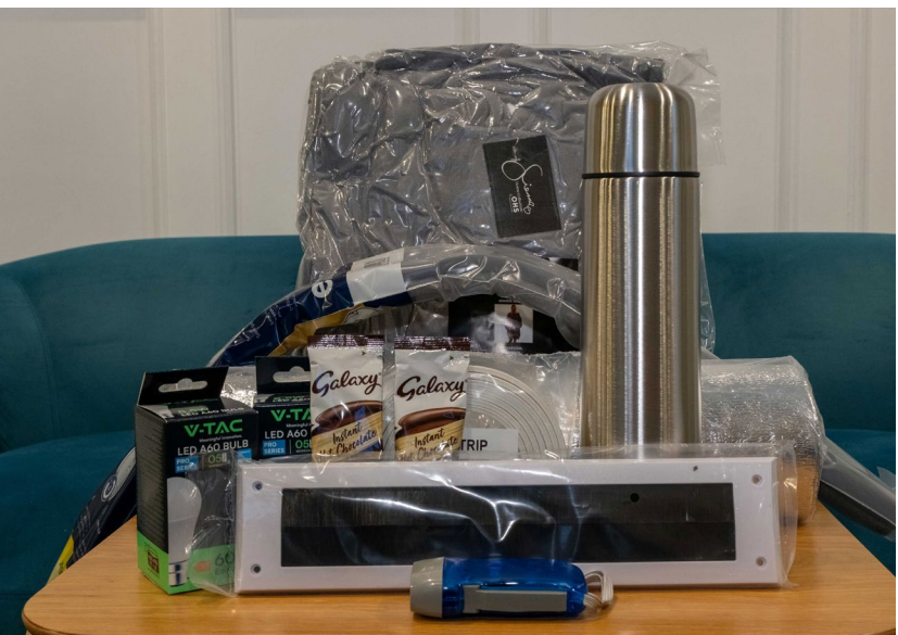
One of our Winter Warmth Support Packs

'I have received my air fryer and heated airer, I just want to say thank you so much for your help you have been amazing!'