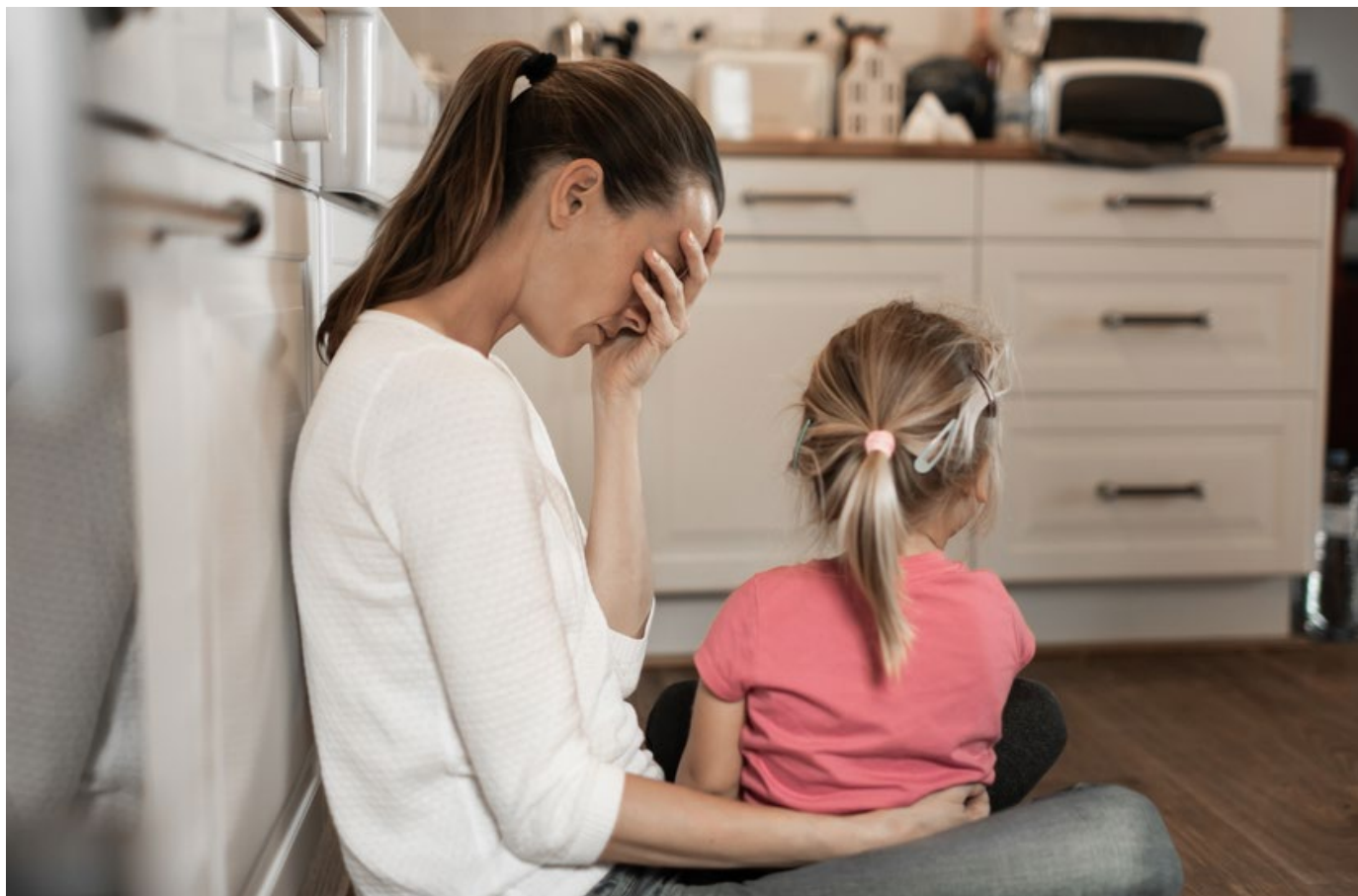
Models used.

particularly likely to be worried about energy. A recent YouGov poll for National Energy Action found that: