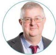
Mark Drakeford First Minister