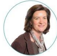
Eluned Morgan Minister for Health and Social Services