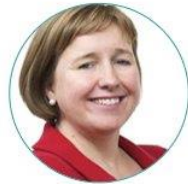
Lynne Neagle Deputy Minister for Mental Health and Wellbeing