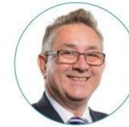
Mick Antoniw Counsel General and Minister for the Constitution