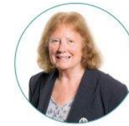
Julie Morgan Deputy Minister for Social Services