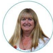
Julie James Minister for Climate Change