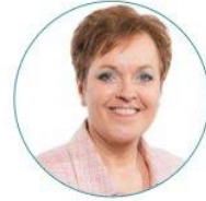
Dawn Bowden Deputy Minister for Arts, Sports and Chief Whip