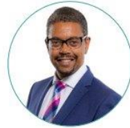
Vaughan Gething Minister for Economy