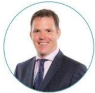
Lee Waters Deputy Minister for Climate Change