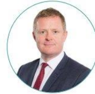
Jeremy Miles Minister for Education and Welsh Language