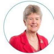
Jane Hutt Minister for Social Justice