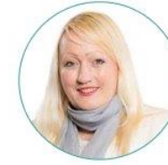
Rebecca Evans Minister for Finance and Local Government