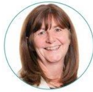
Lesley Griffiths Minister for Rural Affairs, North Wales and Trefnydd